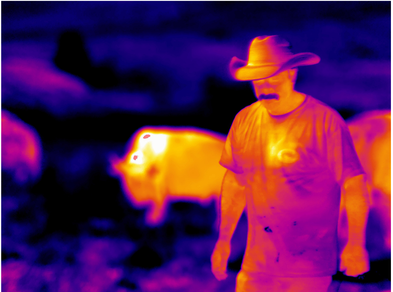
Photo 2. Montana "Buffalero" in the summer sun.