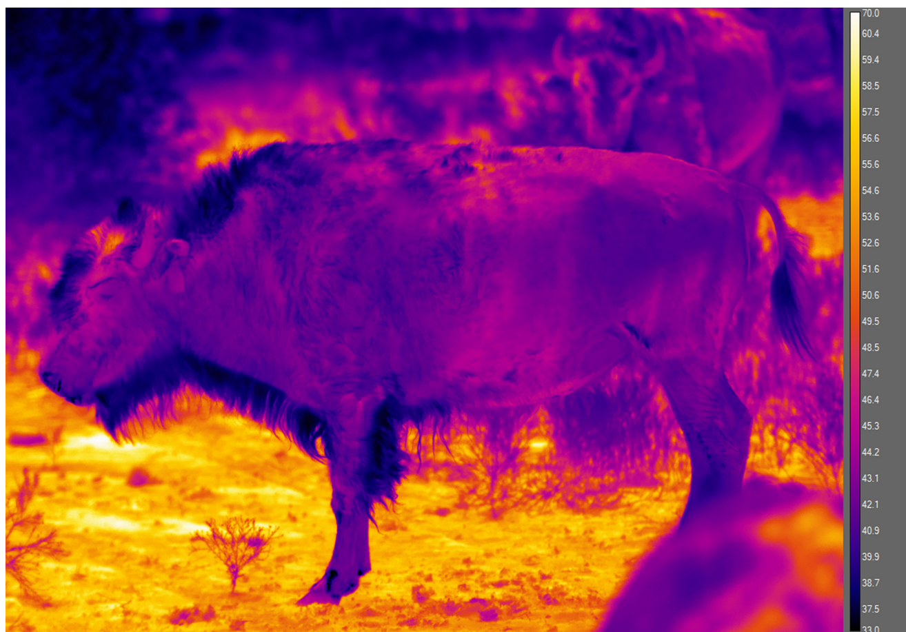
Photo 3. Thermal image of bison yearling on a hot Texas day, summer 2017. Temperature ranges from 33°C (black and blues) to 70°C (yellows and whites) for the soil.