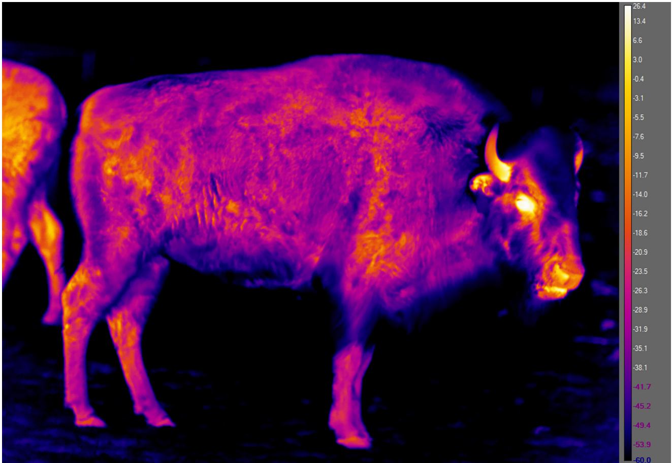
Photo 4. Thermal image of bison yearling on a cold Saskatchewan winter day in 2017. Temperature ranges from -60^{\circ}\text{C} (black and blues; ground and snow) to 26^{\circ}\text{C} (yellows and whites) for the eyeball.

These photographs illustrate the article “Thermal biology and growth of bison ( Bison bison ) along the Great Plains: examining four theories of endotherm body size” by Jeff M. Martin and Perry S. Barboza published in Ecosphere . https://doi.org/10.1002/ecs2.3176